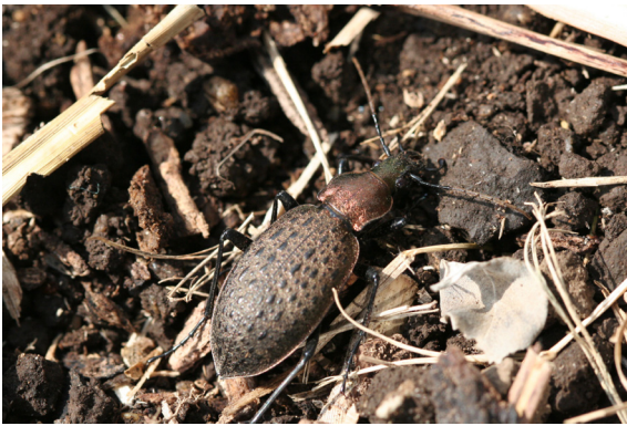
Fig. 6. Damaster smaragdinus Von Waldheim Fischer, 1824.