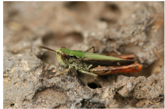
Fig. 4. Omocestus haemorrhoidalis (Charpentier, 1825).