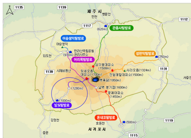
Fig. 1. Survey area of Yeongsil in Hallasan Mountain National Park.

Insect nets were used to collect flying insects, such as dragonflies, sweeping method was used in areas of dense tree and shrub population, and insects living on decaying trees and dried leaves were collected after turning over or digging for them. In order to capture nocturnal insects, portable generator (220V mercury lamp) and UV bucket light traps (Bioquip 12V, 18AH, 31.3Cm in diameter,