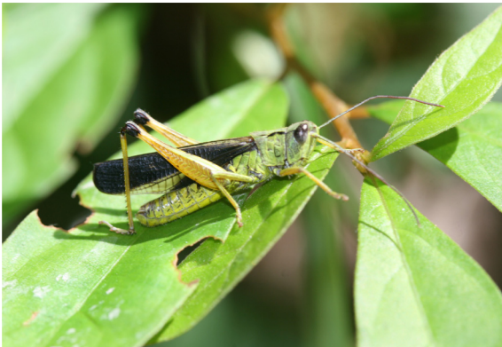
Fig. 3. Megaulacobothrus jejuensis Kim, 2007.