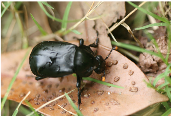
Fig. 7. Nicrophorus concolor Kraatz, 1877.

to 4 families and 3 orders were found, including the Rhantus yessoensis Sharp of family Dytiscidae and order Dytiscidae, the Aphthona perminuta Baly of family Chrysomelidae, the Camponotus obscuripes Mayr of family Formicidae and order Hymenoptera, and the Panorpa approximata Esben-Petersen of family Panorpidae and order Mecoptera.