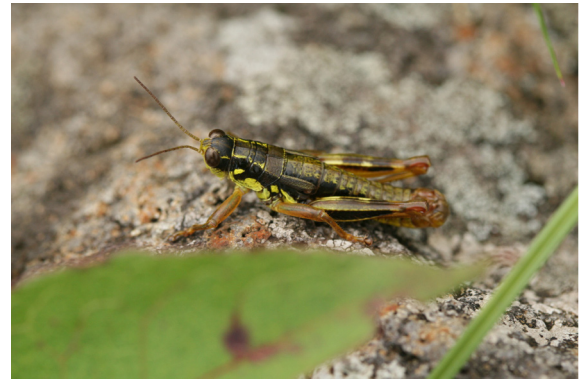
Fig. 5. Prumna halrasana (Lee et Lee, 1984).

Orthoptera species (7.53%), 8 Diptera species (5.47%), 5 Odonata species (3.42%), and 1 species each of families Neuroptera, Phasmatodea and Mecoptera (0.68%) (Table 1, Fig. 2).